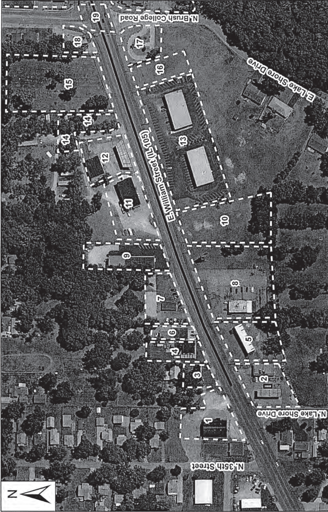
Attachment 2, page 1. Site location map, Sites 2523-1 through 2523-19. All site boundaries are approximate and should not be used as actual parcel boundaries. Project area indicated by solid black line.